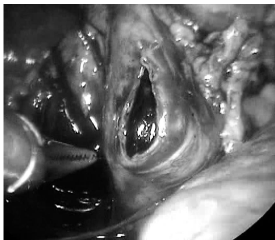
Figure 3. Choledochotomy must match the size of the larger stone.

These 9 patients were operated on with the intention of performing LCBDE; however, the conversion rate was 33.3%. Intrahepatic bile duct stones and embedded stones